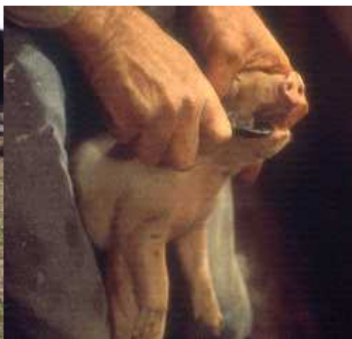
Tooth Removal

vessels are cut (because there is not enough time for the animal to die) most of them are still alive and feel pain and horror. They are thrown in hot water tanks to make pull out their body hair easier. In the United States, every year around 100 million pigs are murdered to be consumed as food.