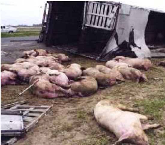
Animal Transport Accident