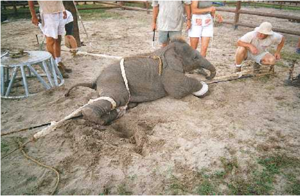
Baby Elephant Training